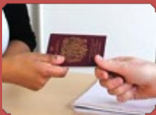
Illustration 1: Summary of a manual right to work check

There are 3 basic steps to conducting a manual right to work check. Illustration 2 explains in more detail what you need to do in each of the 3 steps to correctly conduct a manual right to work check and establish a statutory excuse. You need to complete all 3 steps before employment commences to ensure you have conducted the prescribed check fully.